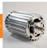
Mining & Processing