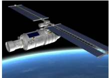
Aerospace & Defense