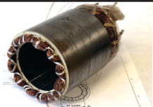
Motors & Transformers